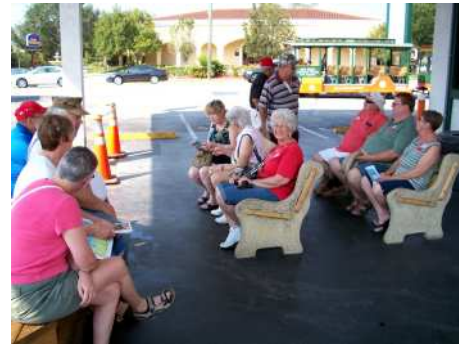
Waiting on the Old Town Trolley San Marcos Avenue